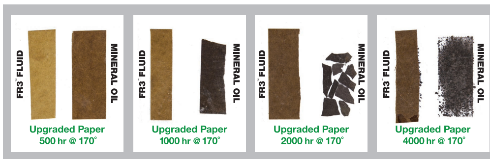
Insulation aging study comparing thermally upgraded paper using FR3 fluid vs. mineral oil.

Insulation paper is one of the primary factors that determines the life of a transformer. FR3™ fluid's unique chemistry absorbs free water and essentially wicks it away from the insulation paper. FR3 fluid has 10 times the water saturation level of mineral oil. This results in extending the insulation life 5-8 times longer than mineral oil.